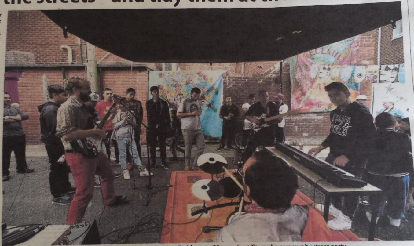
The CHAT Trust who have been actively working in the West End for over 20 years host 'Stomp!' a community street party

"It's great to see people of all ages and ethnicities reclaiming the back lanes and working together to promote recycling. This is an excellent way to get residents involved while reinforcing the importance of keeping our back lanes clean and tidy."