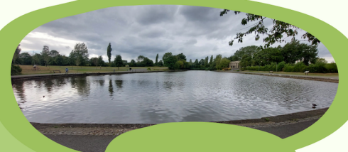
Exhibition Park Lake

Alternative start from Jesmond underpass