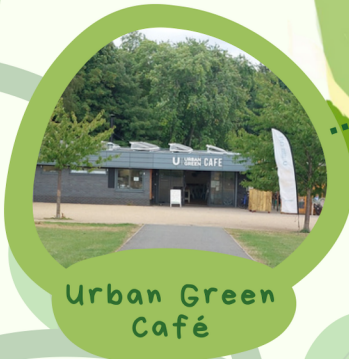
Urban Green Café