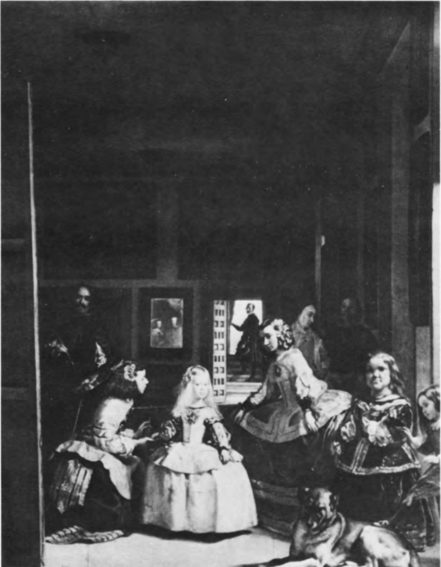
Diego Velazquez. Las Meninas. 1656.