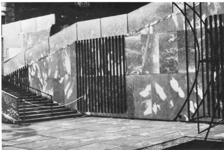
Daniel Buren. From and Off the Windows. 1974.

Contemporary Artists , held at the Museum of Modern Art in the fall of 1974. 1 Although she found the work in the show “bland and tepid” and therefore something “normally one would overlook,” she felt compelled to speak out because this show was organized by our most prestigious institution of modern art and, for that reason alone, it became significant. But the work in the show was bland and tepid to Rose only from an aesthetic standpoint; it was more potent as politics: