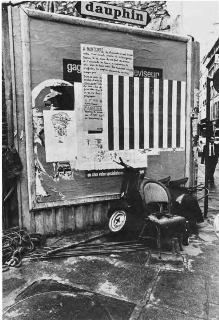
Daniel Buren. Exhibition, Rue Jacob, Paris. 1968.

painting will be understood as the “pure idiocy” that it is. At the moment when Buren’s work becomes visible, the code of painting will have been abolished and Buren’s repetitions can stop: the end of painting will have finally been acknowledged.